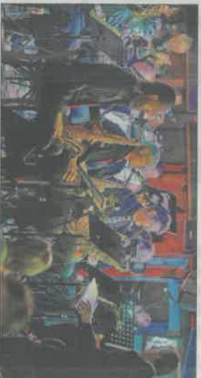
The Georgia Strait Big Band will back an all-star line-up at the inaugural "Chili and Denim" fundraiser evening.

More information on the CVCDA Facebook site or by phone at 250-338-4288.